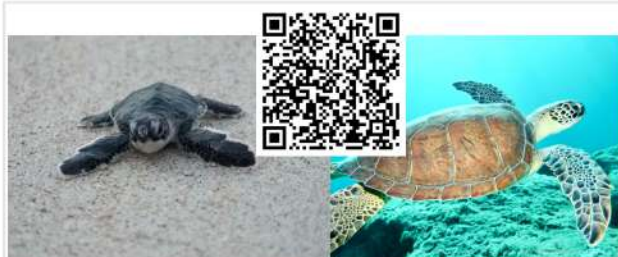
La tortue - the tortoise