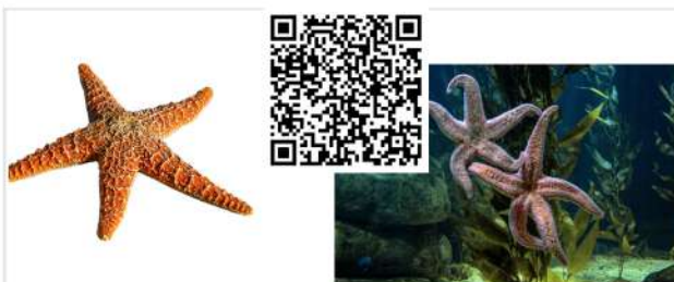
L'étoile de mer - the starfish