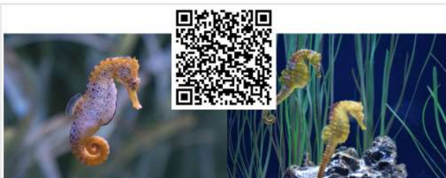
L'hippocampe - the seahorse