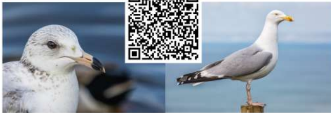
La mouette - the seagull

Scan the code to hear the French and English pronunciation.