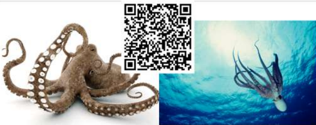
La pieuvre - the octopus