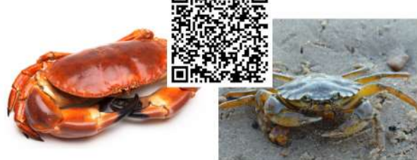
Un crabe - A crab