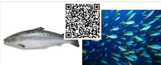
Le poisson - the fish